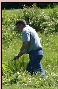
Some golfers were not so fortunate...

We would also like to thank all our wonderful volunteers who helped keep the day organized and assist in making this event a great success!