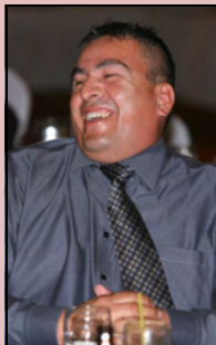
Did I really bid that much?!?

One of the highlights of the night was showcasing NAABA's new Promotional Video, "One Voice". The video consisted of Young Aboriginal Businesses as well as words of wisdom from some of the people who have already walked the long road of sustaining their Local Aboriginal Business. The video was a